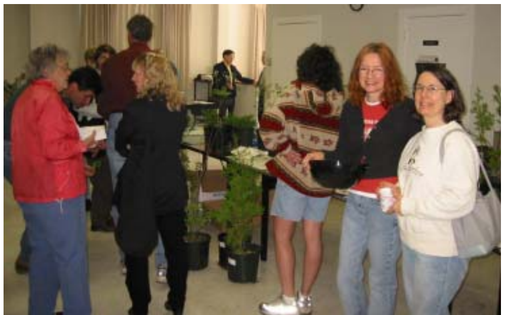
Members networking after meeting.